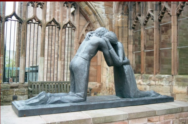
Reconciliation, a sculpture by de Vasconcellos

There are many ways people can be alienated from each other in this broken world but only God can make it whole.